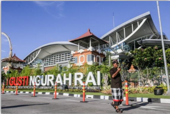
At The Airport